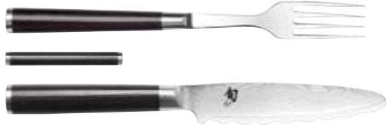
DM-0908 Large Blade Steak Knife and Fork Set with Table Rest