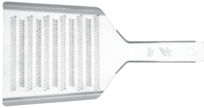
DM-0900 Micro grater Stainless steel 27,5/14,3 cm L/W

Oroshigane - the traditional Japanese tool is an excellent choice for ginger and wasabi. Its extremely sharp serration grinds very smoothly and allows the flavour to flower out even better. It can be used on both sides (smooth / very smooth). Its large grating surface provides for comfortable work. Suitable for ginger, wasabi, radish, garlic, tomatoes and much more.