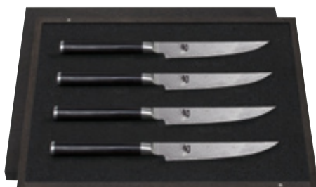
DMS-400 Shun steak knife set in a fine wooden box 4x DM-0711 29,0/20,2/2,4 cm L/W/H