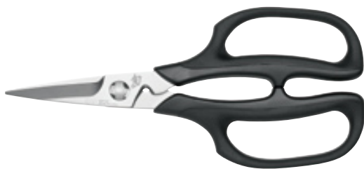
DM-7100 Japanese Kitchen Scissors Blades: 5,0 cm