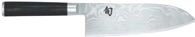
DM-0717 Large Santoku Blade: 7.5" (19,0 cm) Handle: 12,2 cm