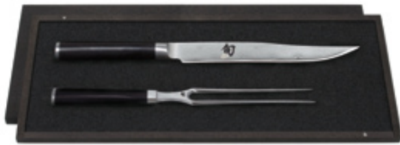
DMS-200 Shun carving set in a fine wooden box DM-0703 + DM-0709 39,6/15,6/3,2 cm L/W/H