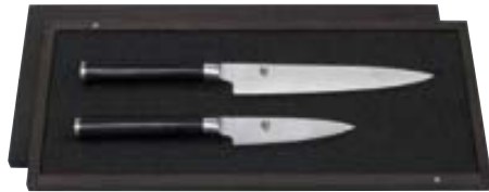
DMS-210 Shun knife set in a fine wooden box DM-0700 + DM-0701 31,0/12,5/2,4 cm L/W/H