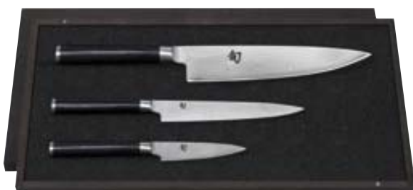
DMS-300 Shun knife set in a fine wooden box DM-0700 + DM-0701 + DM-0706 39,6/20,6/3,2 cm L/W/H