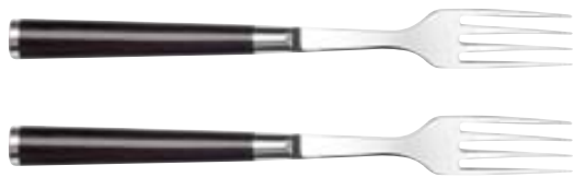
DM-0990 2pcs Fork Set