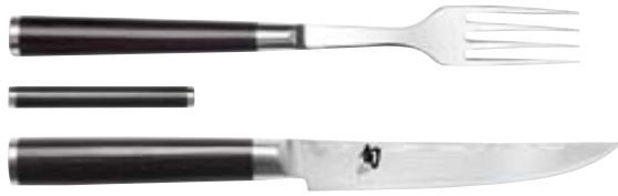
DM-0907 Steak Knife and Fork Set with Table Rest