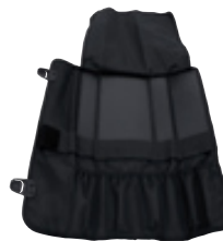
DM-0781 KAI knife bag for 3 large and 2 small knives closed: 45,0/16,0/7,0 cm L/W/H open: 45,0/43,0 cm L/W

The knife bags are the ideal storage for knives, especially for the professional chef on the road. The knives are secured with a new hook-and-loop fastening system. They are stored safely and the blades do not touch each other. The bag comes with a carrying strap.