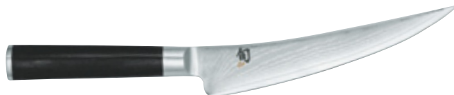
DM-0743 Gokujo boning knife Blade: 6.0" (15,0 cm) Handle: 10,4 cm