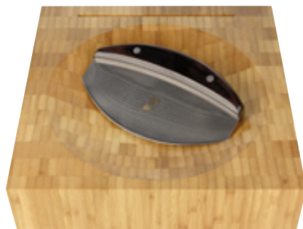
DM-0736 Shun mincing knife Blade: 6.0" (15,0 cm) Block: 24,0/24,0/6,0 cm L/W/H

Together with the wooden cutting block this is the ideal tool to mince herbs and vegetables. The 6" (15 cm) blade is made from the well-known damask steel and fitted with a handle of pakka-wood. The cutting block is made of bamboo wood; it has a cutting mould and a slot on the back where the mincing knife can not only be safely stored but is always to hand.