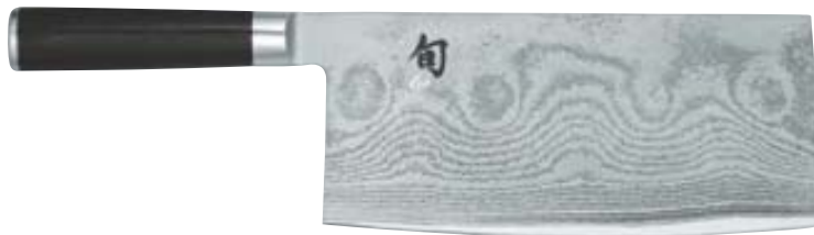
DM-0712 China-Chef's knife Blade: 7.0" (18,0 cm) Handle: 10,0 cm

Each Shun knife gets its unique and individual character by refining the natural beauty of the damask grain. This way every Shun knife is unmistakable and unique – a piece of art, united by craftsmanship, technology and design. Inspired by the masterful art of Samurai swords the technique for manufacturing the finest chef's knives enables the Shun series even to deliver knives with western blade shapes.