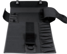
DM-0780 Shun knife bag for 9 large and 8 small knives closed: 54,0/23,0/9,0 cm L/W/H open: 91,0/51,0 cm L/W