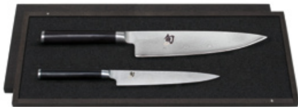
DMS-220 Shun knife set in a fine wooden box DM-0701 + DM-0706 39,6/15,6/3,2 cm L/W/H