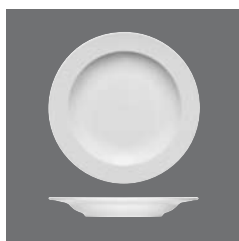
Teller tief Fahne, Plate deep with rim, Assiette creuse à l'aile, Plato hondo con ala, Piatto fondo