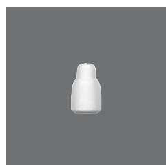
Salzstreuer , Salt shaker, Salière, Salero, Spargi sale

> Sauciere 25 3830 2575/0.30 0,30 (10.14) 152 (5.98) 66 / 317(5) 270