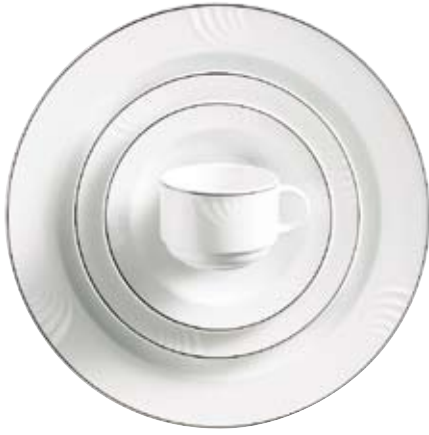
800144 Farblinie Schwarz