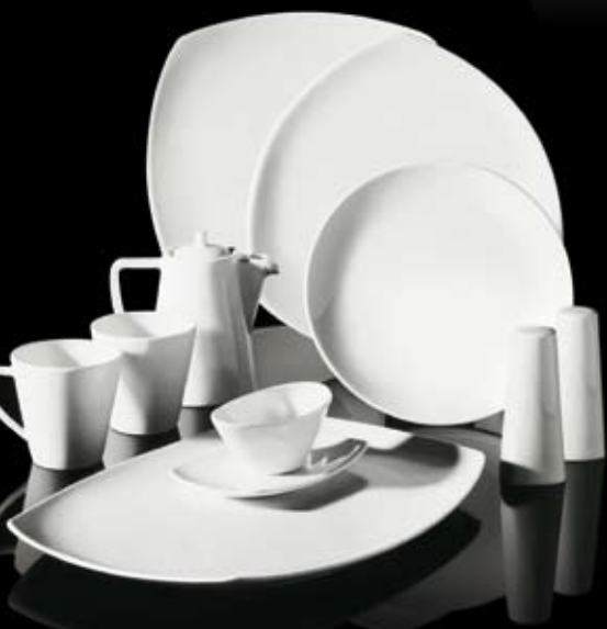
top left: Collection and décor by the art nouveau artist and architect Peter Behrens. Design: Peter Behrens, 1900